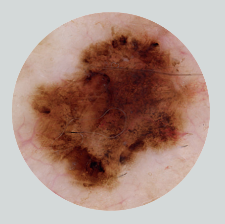
Presentation with one of the new DELTA Dermatoscopes