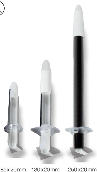
85x20mm 130x20mm 250x20mm